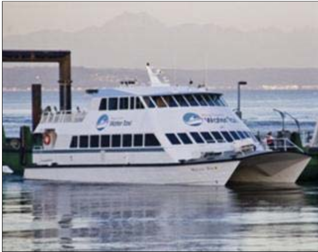
The Melissa Ann is the foot ferry that serves the Vashon-downtown Seattle route.